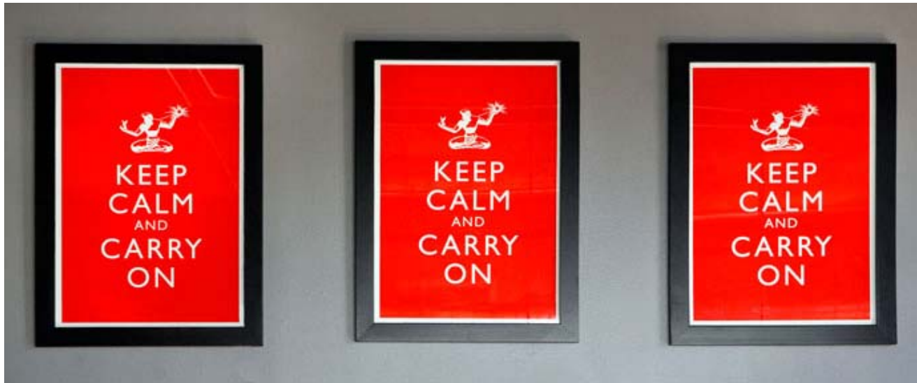
Posters on the wall at Bureau of Urban Living coincide the 50th anniversary of our iconic Spirit of Detroit statue

Home | Neighborhoods | Features | Development News | Job News | In the News | Photo Essays | FilterD | Sign Up